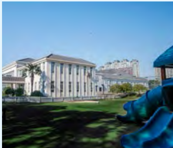
上海·绿大地园 Shanghai · Greenhills Campus