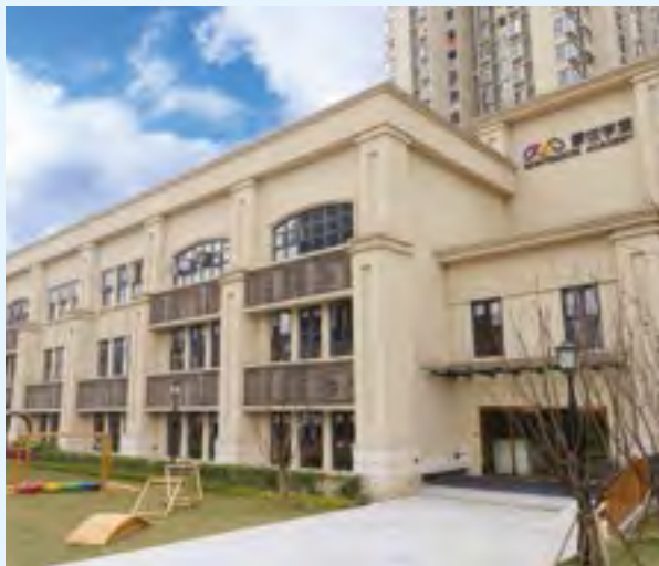
重庆·渝北园 Chongqing · Chongqing Campus