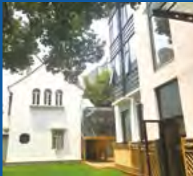
上海·徐汇 Shanghai · Xuhui Area