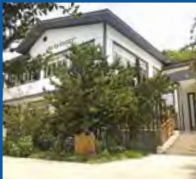
杭州·上城 Hangzhou · Shangcheng Area