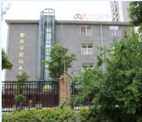
武汉·楚汉新居园 Wuhan · Wuhan Campus