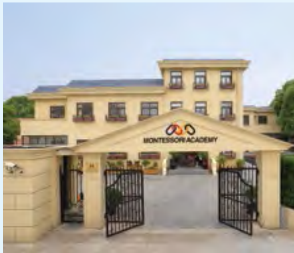
上海·灵山园 Shanghai · Lingshan Campus