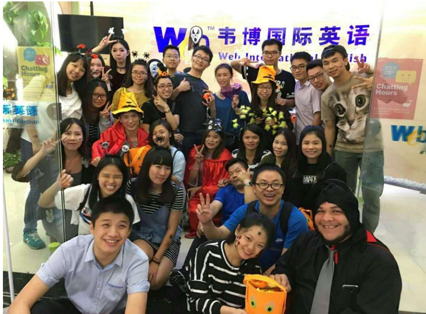
Both students and teachers enjoy the ECAs.