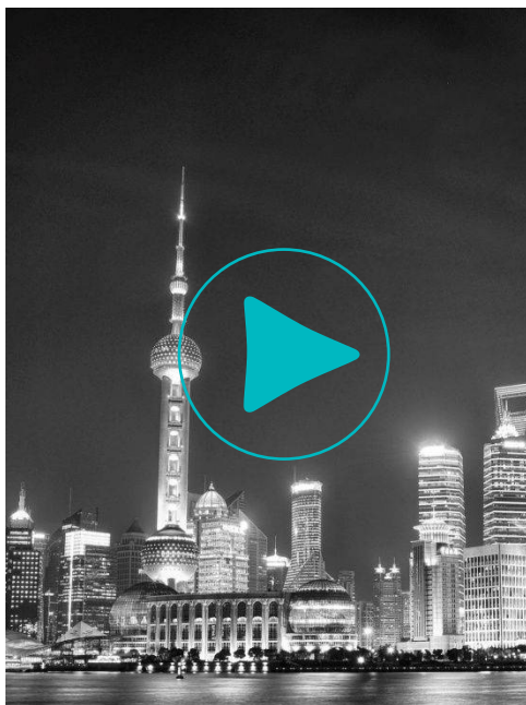
02 Exploring China