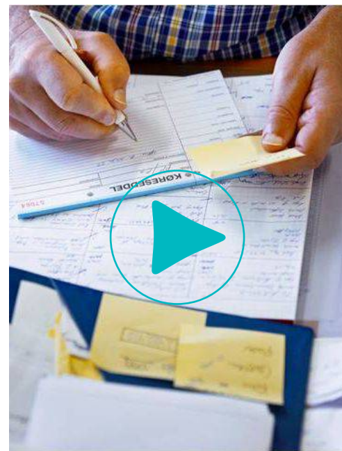
04 How to do