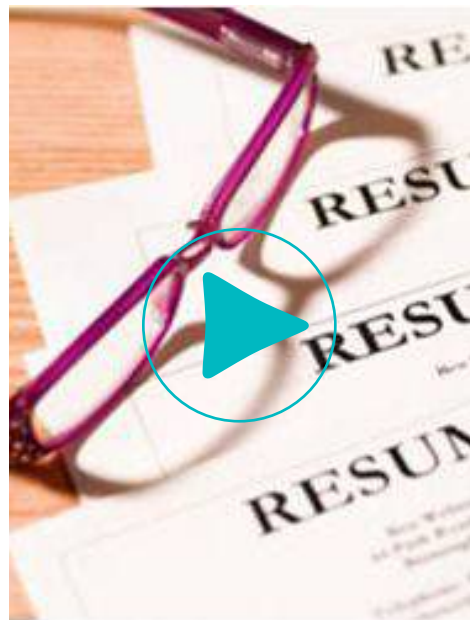
03 About the Job